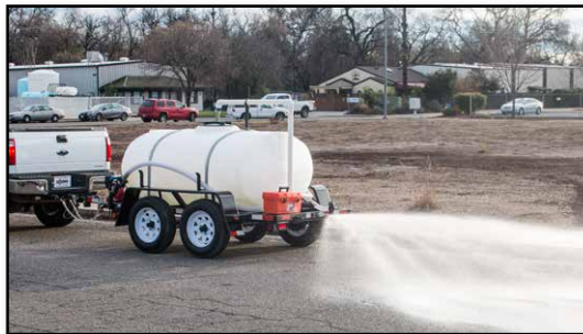
The rear mounted water nozzle creates a 16' wide pattern